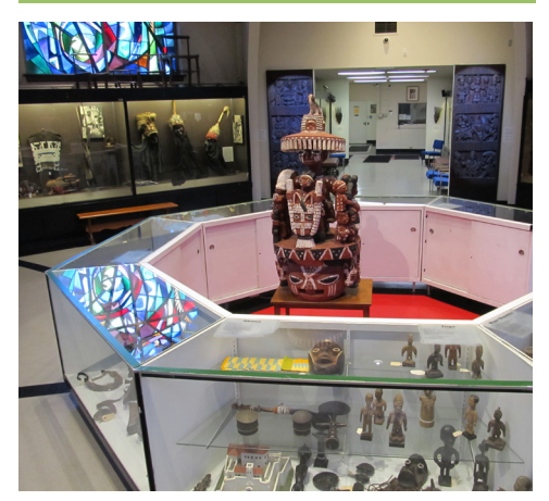
African Art Museum of the SMA Fathers, Tenafly